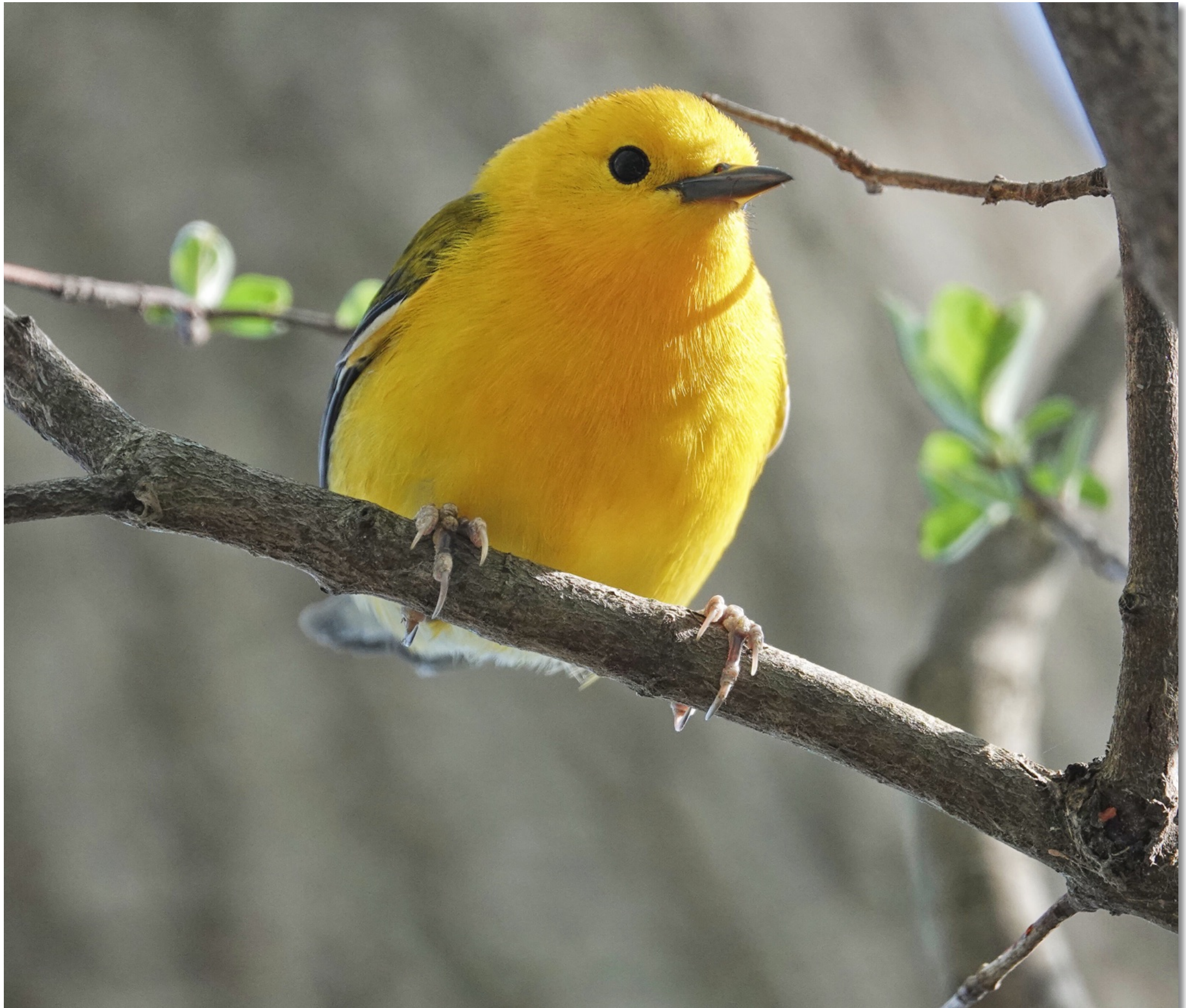
Prothonotary Warbler, Magee Marsh, Ohio, USA, Program/birds&wildlife, 1/500th @ f4 @ ISO 500. Polarr