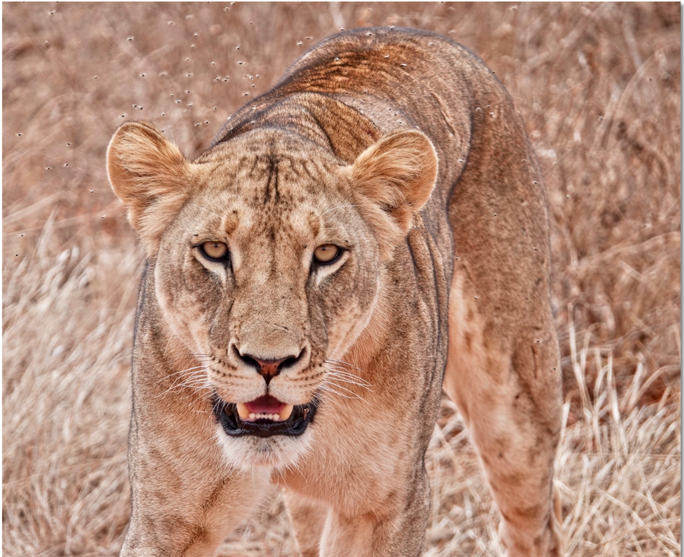
Lion, Tsavo East National Park, Kenya. 472mm, Program/birds&wildlife, 1/640 @ f4 @ ISO 100, Polarr