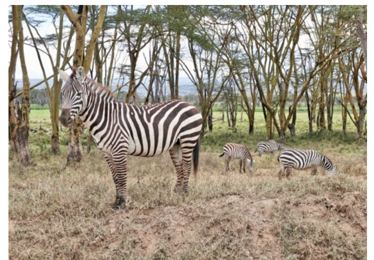
Baboons, Kori Bustard, Lions, Tsavo East NP...Zebras, Lake Nakuru NR, Kenya. Program/birds&wildlife, Polarr