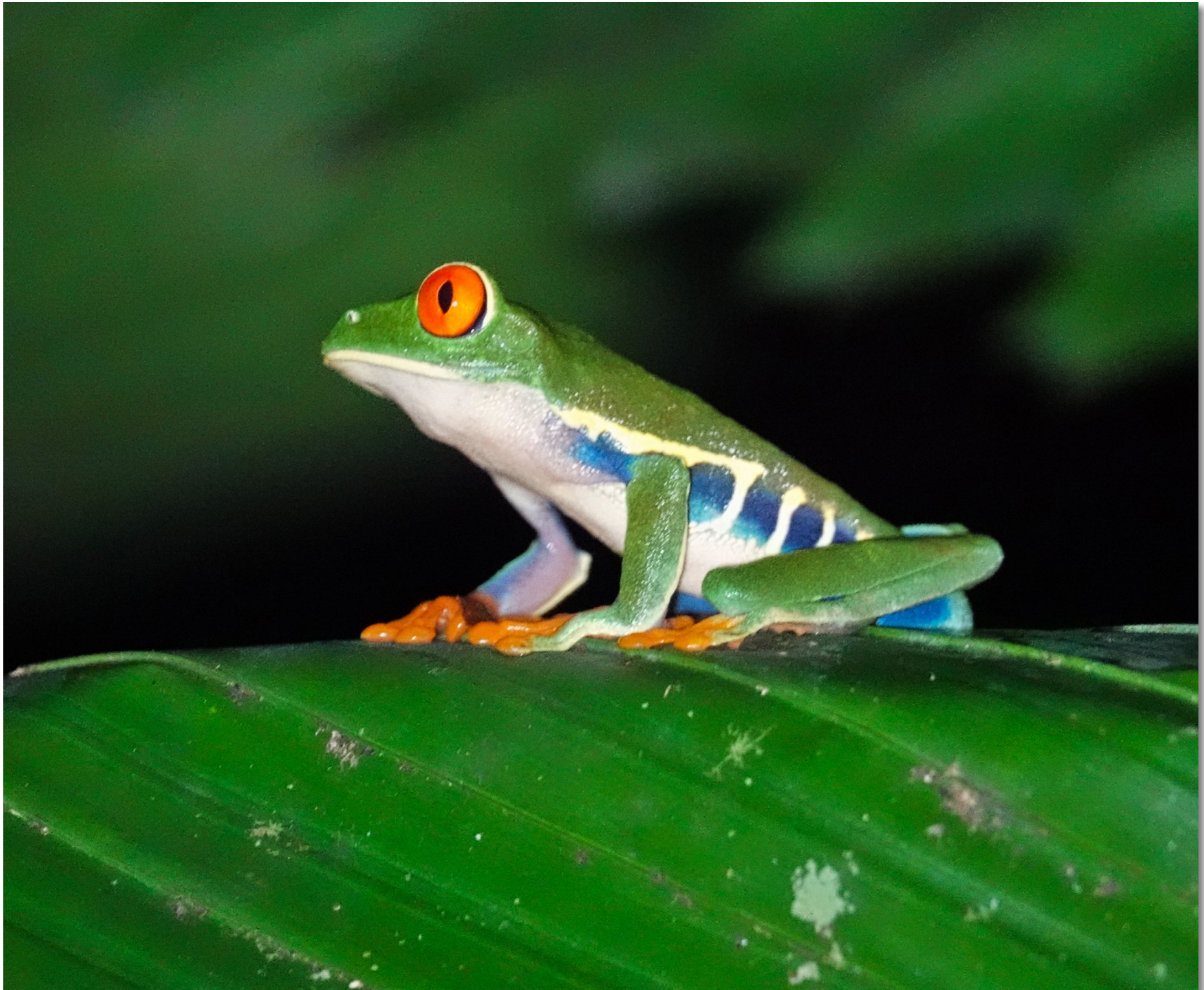
Red-eyed Leaf Frog, Selva Verde, Costa Rica, 600mm, using a flashlight and Anti Motion Blur mode. 1/60th @ f4 @ ISO 6400, Polarr