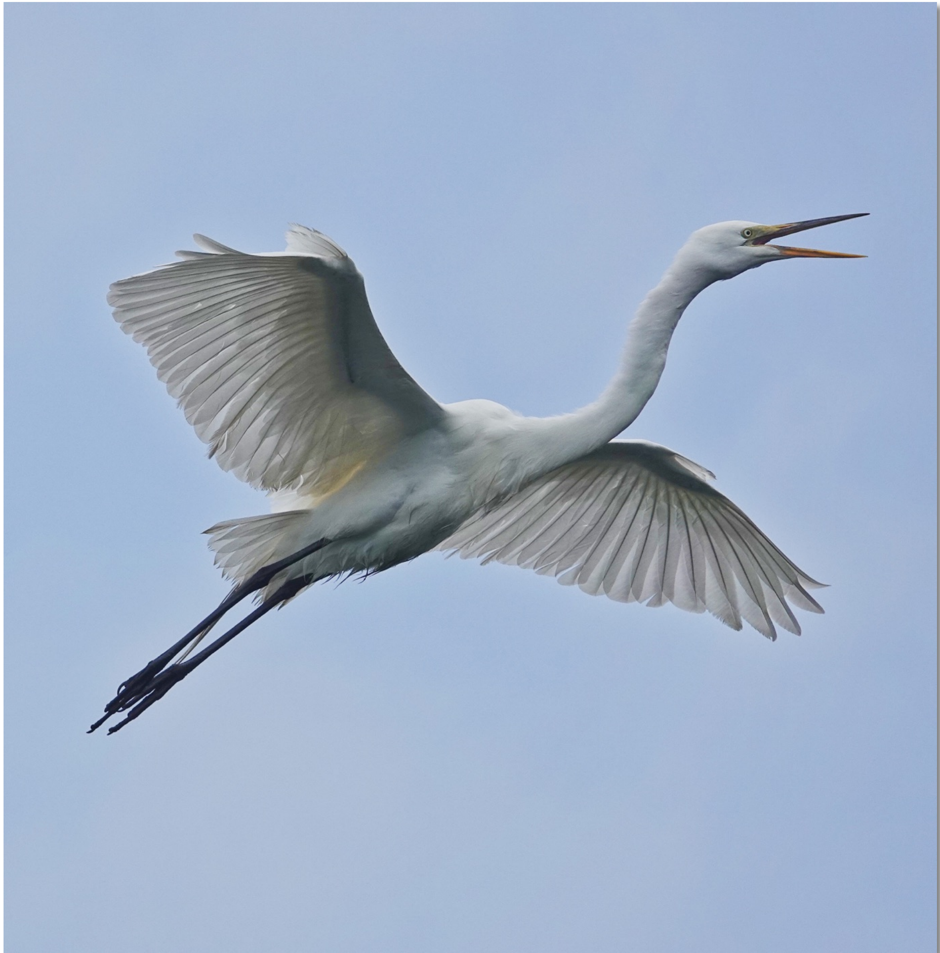
Great Egret, St Augustine, Florida, USA, 486mm, Program/BIF&action, 1 / 1000th @ f6.3 @ ISO 125, Polarr.