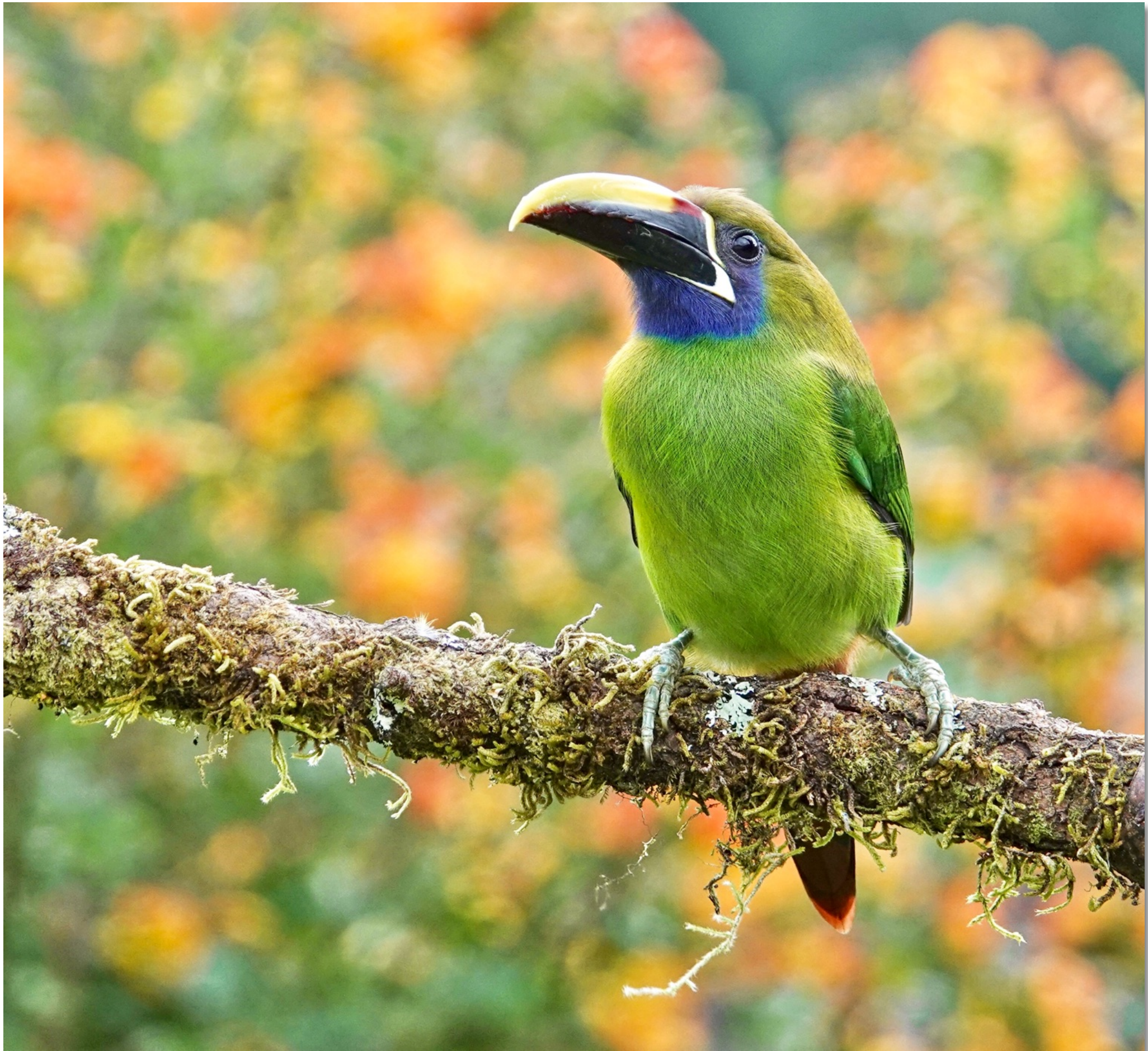
Emerald Toucanet, San Gerardo de Dota, Costa Rica, 600mm, Program/birds&wildlife, 1/250th @ f4 @ ISO 200. Polarr