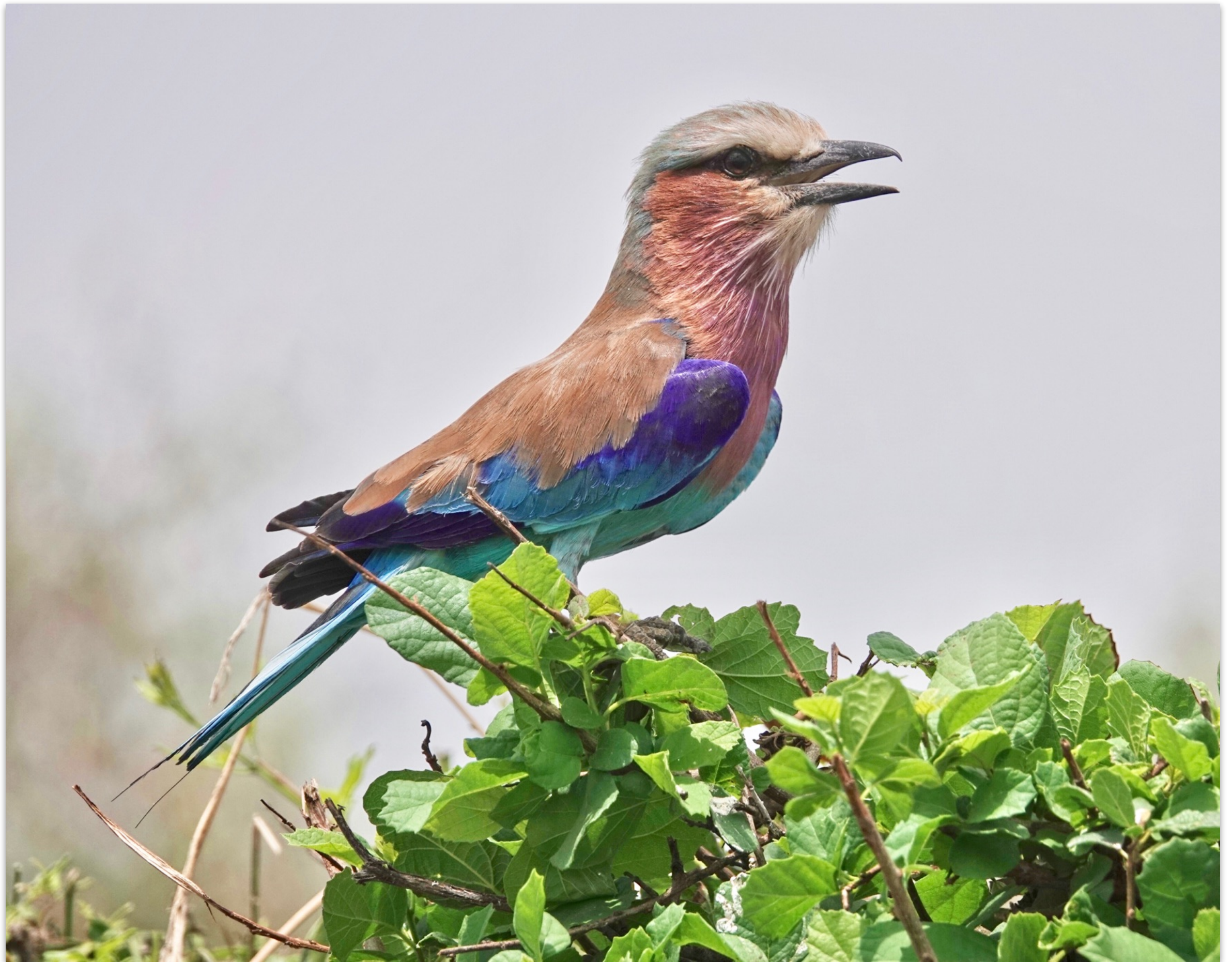
Lilac-breasted Roller, Tsavo West NP, Kenya. 600mm, Program/birds&wildlife, 1/1000th @ f5 @ ISO 100, Polarr