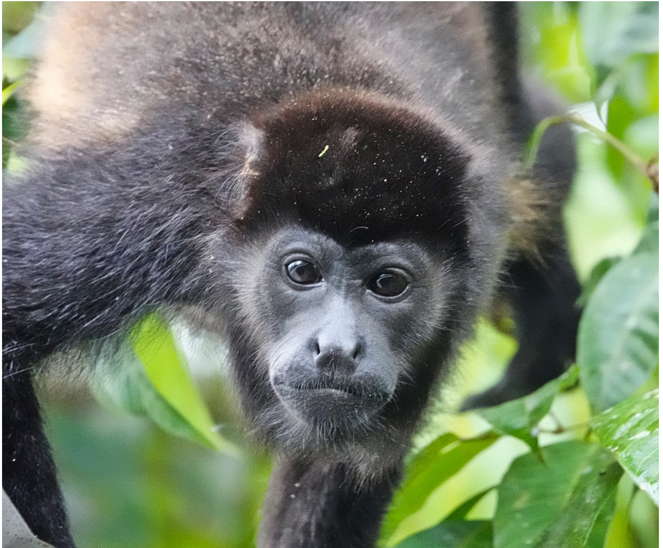
Howler Monkey, Selva Verde, Costa Rica, 600mm, Anti-motion blur mode, nominally 1/200th @ f4 @ ISO 6400. Polarr