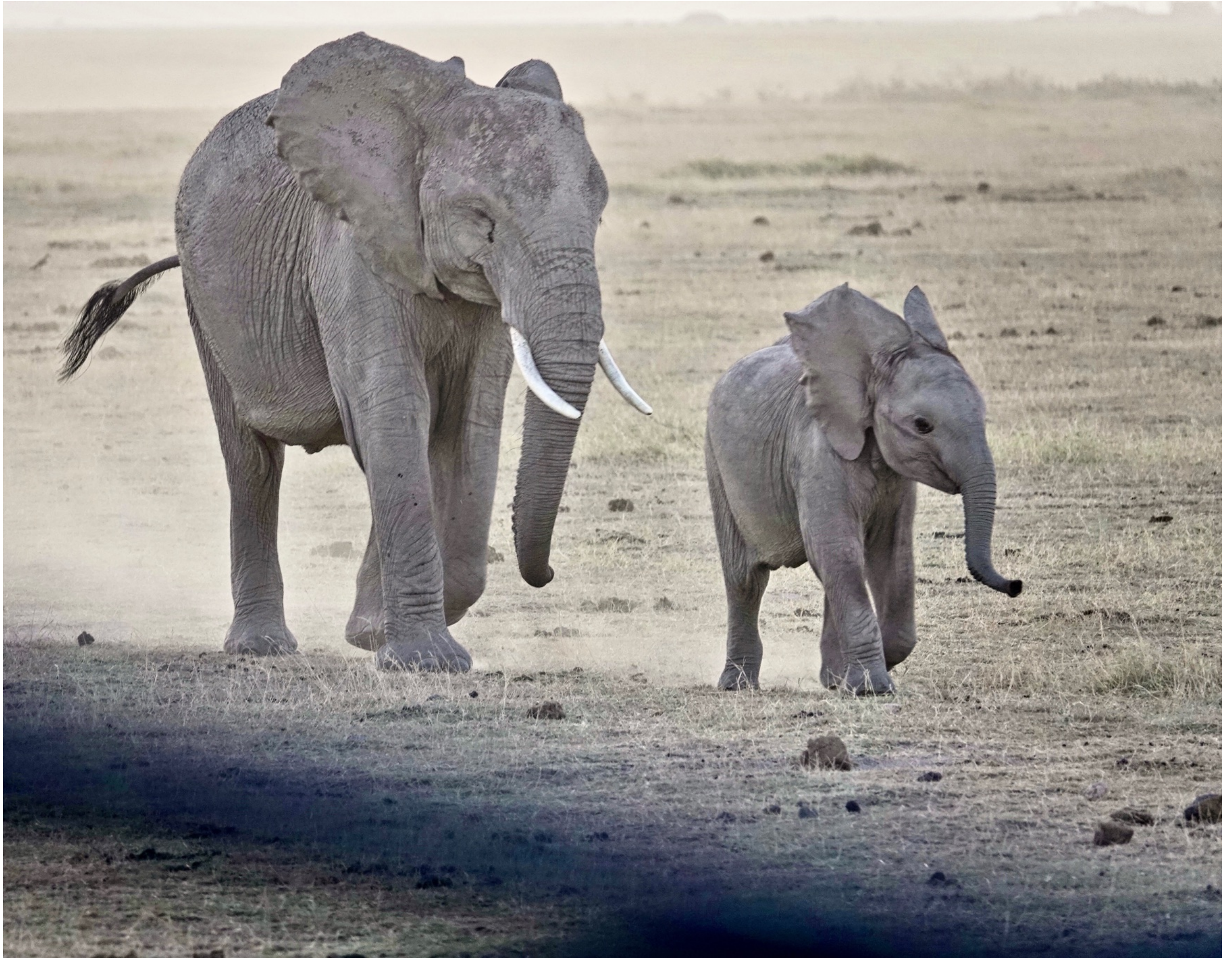
Elephants, Tsavo East NP, Kenya. 480mm, Program/birds&wildlife, 1/250th @ f4 @ ISO 160. Polarr