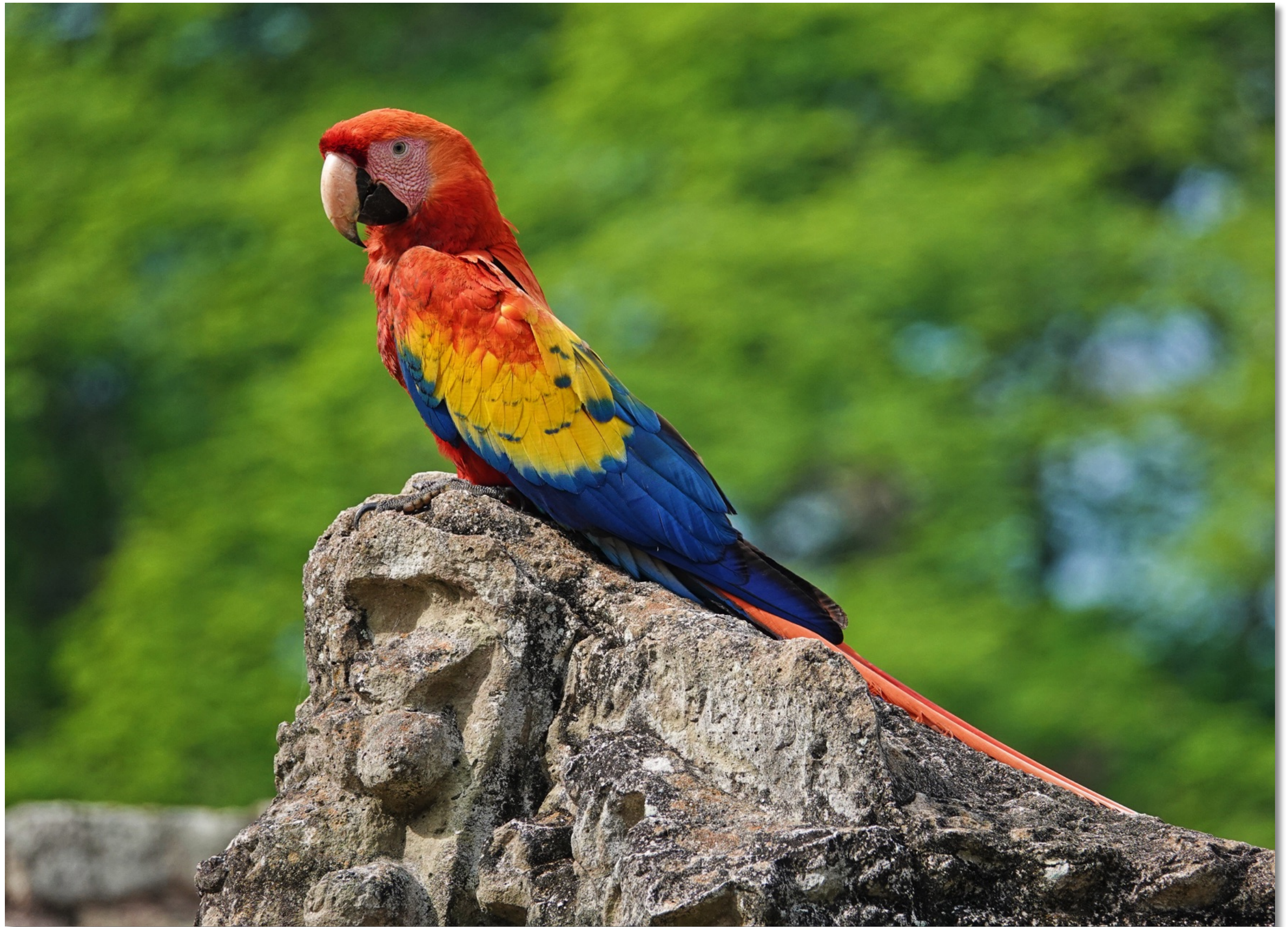
Scarlet Macaw, Copan Ruins, Honduras, 524mm, Program/BIF&action, 1/1000th @ f4 ! ISO 250, Polarr