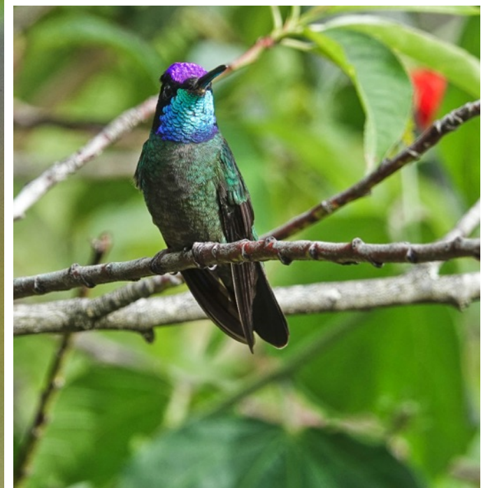
Lesser Violet-ear, Fire-throated, and Talamanca Hummingbirds, San Gerardo de Dota and Siberia, Costa Rica. 600mm, Program/birds&wildlife, 1/250th @ f4 @ various ISO, Polarr