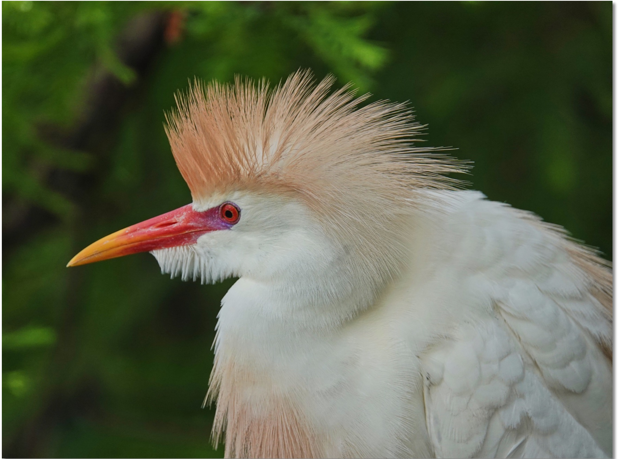
Cattle Egret, St Augustine, Florida, USA, 600mm, Program/birds&wildlife, 1/1000th @ f4 @ ISO 200. Polarr