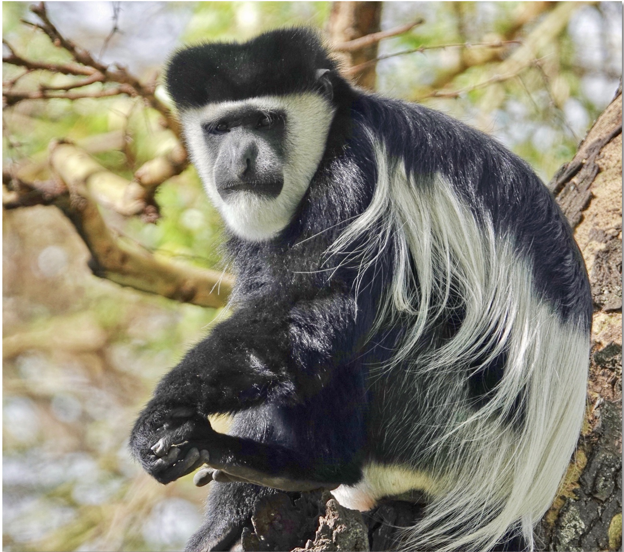
Black and white Colobus Monkey, Lake Naivasha, Kenya. 600mm, Program/birds&wildlife, 1/250th @ f4 @ ISO 160, Polarr