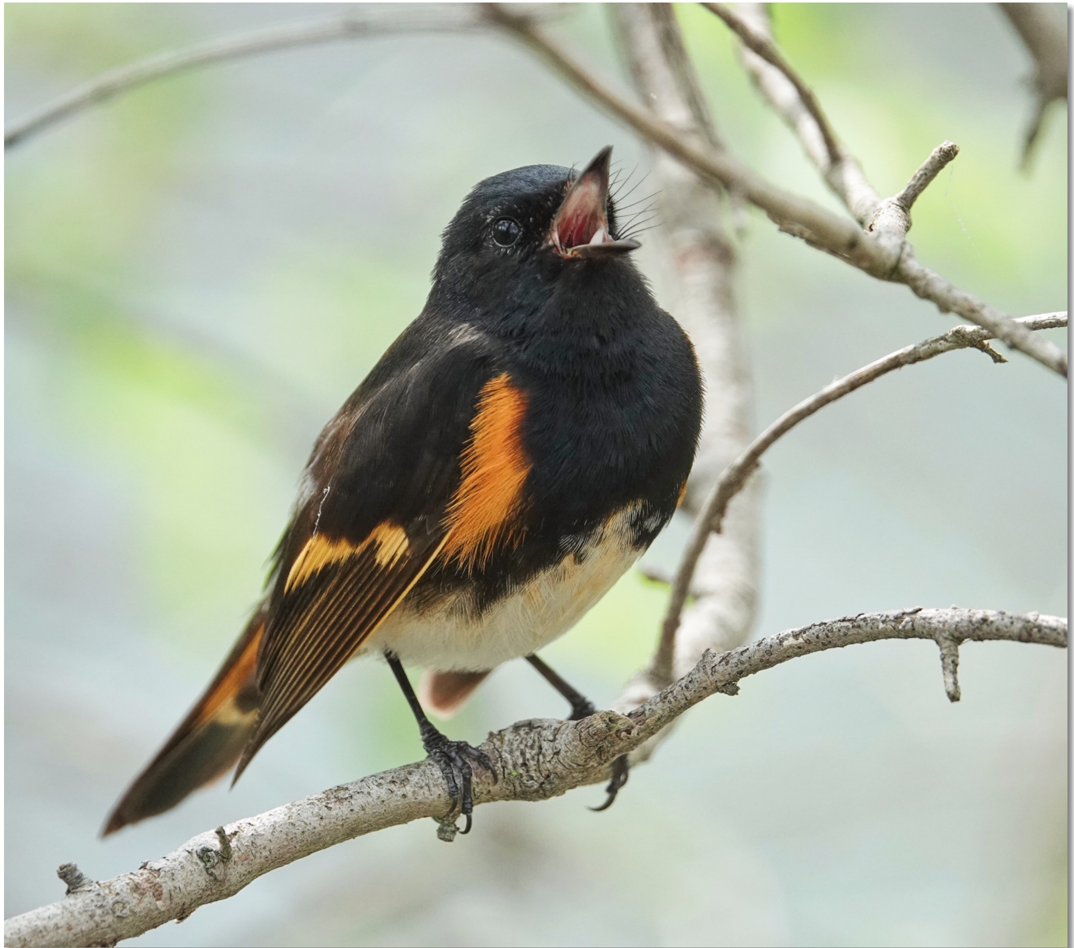
American Redstart, Magee Marsh, Ohio, USA, 600mm, Program/birds&wildlife, 1/500th @ f4 @ ISO 500. Polarr