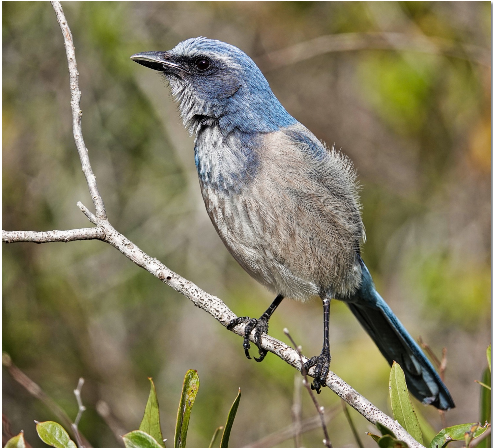
Florida Scrub-Jay, Rockledge, Florida, USA, 500mm, Program/birds&wildlife, 1/800th @ f4 @ ISO 100. Polarr