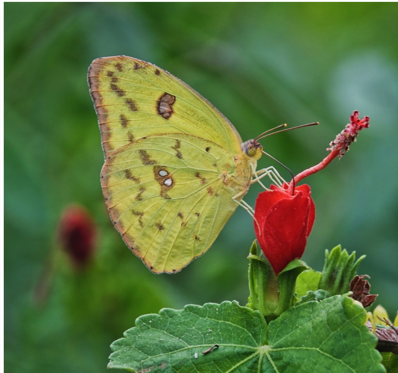
Flame Skimmer, Tucson AZ, USA, Large Orange Sulphur, Mission, TX, USA, Blue Doctor, La Selva, Costa Rica. 600mm, Program / birds&wildlife. Polarr.