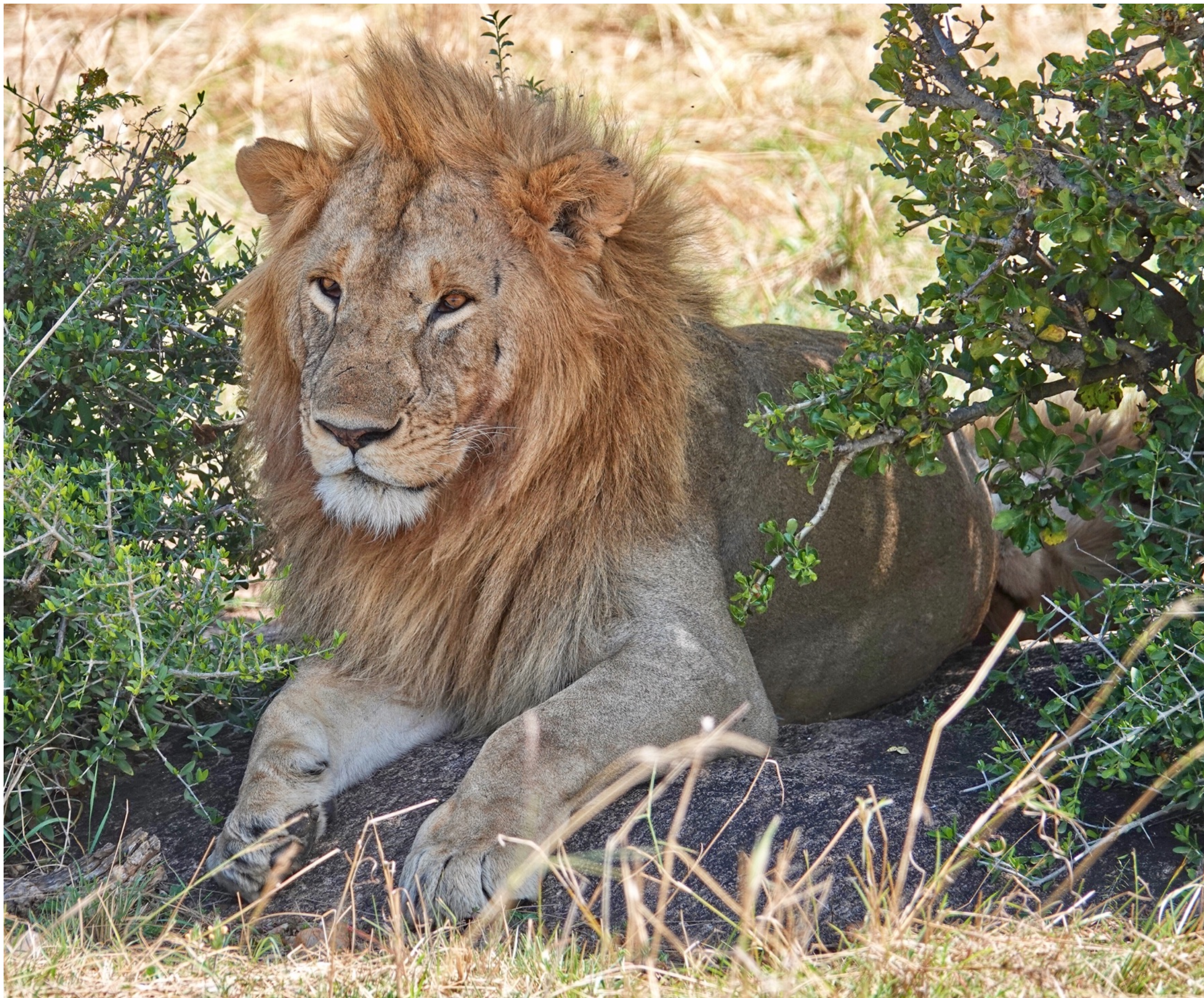
Lion, Masai Mara, Kenya. 450mm, Program/birds&wildlife, 1/250th @ f4 @ ISO 125, Polarr