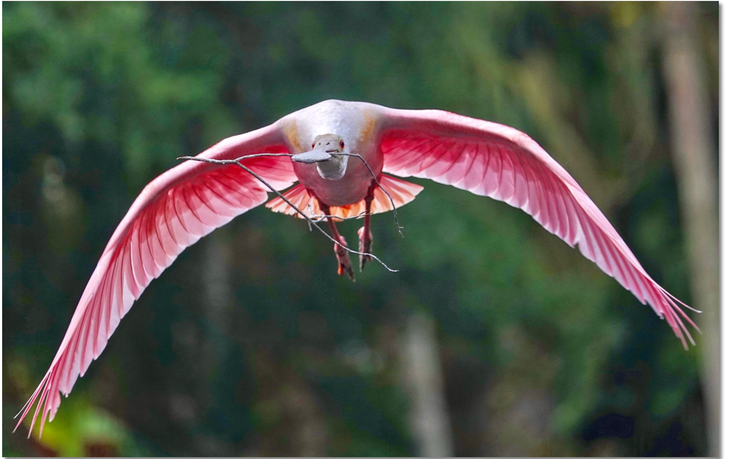
Roseate Spoonbill, St. Augustine, Florida, USA, Program mode/BIF&action. 1/1000th @ f4 @ ISO 100. Polarr.