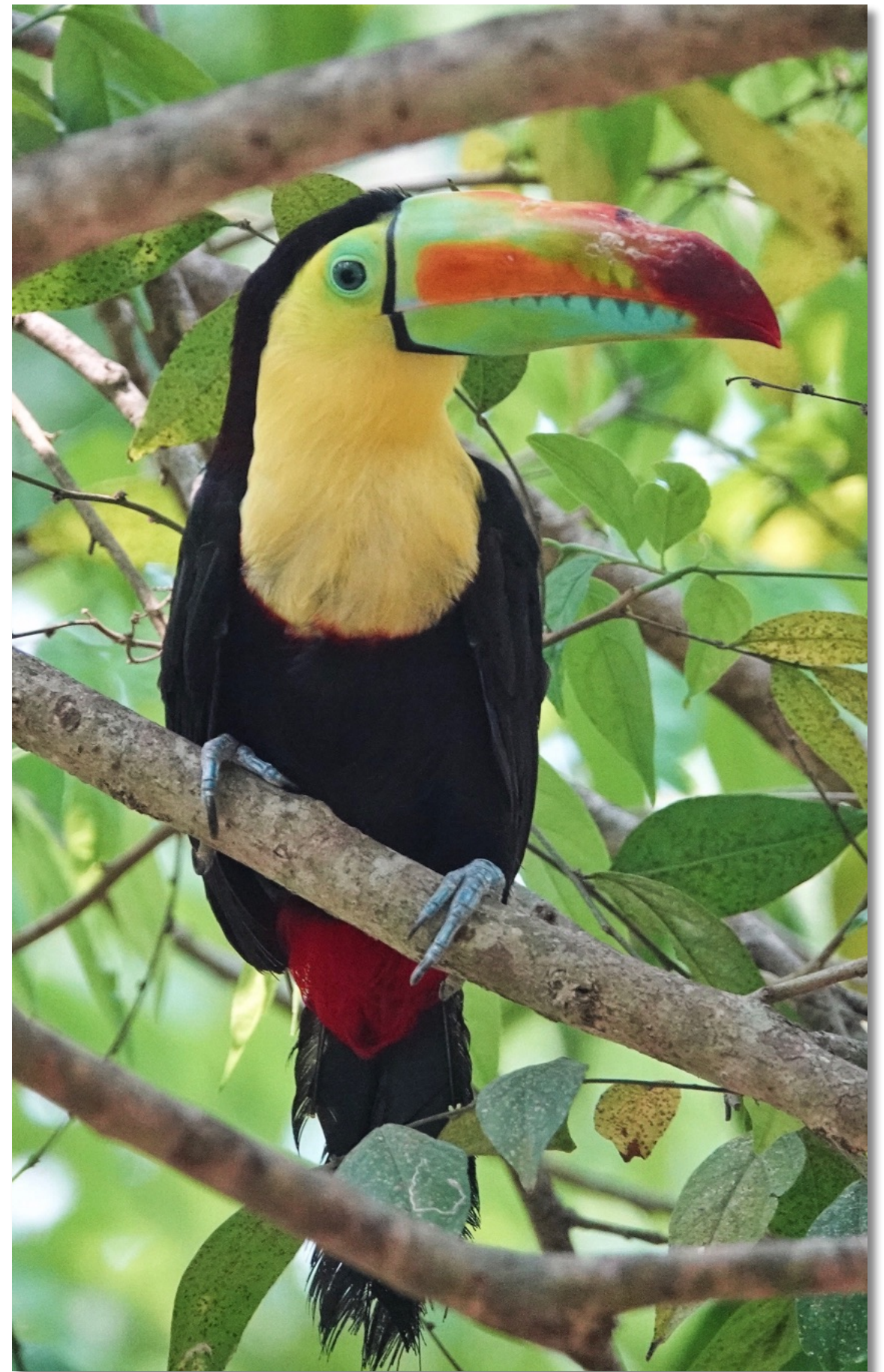
Turquoise-browed Motmot and Keel-billed Toucan, Copan Ruins, Honduras, 600mm, Program /birds&wildlife, 1/500th @ f4 @ ISO 640 and 2000.