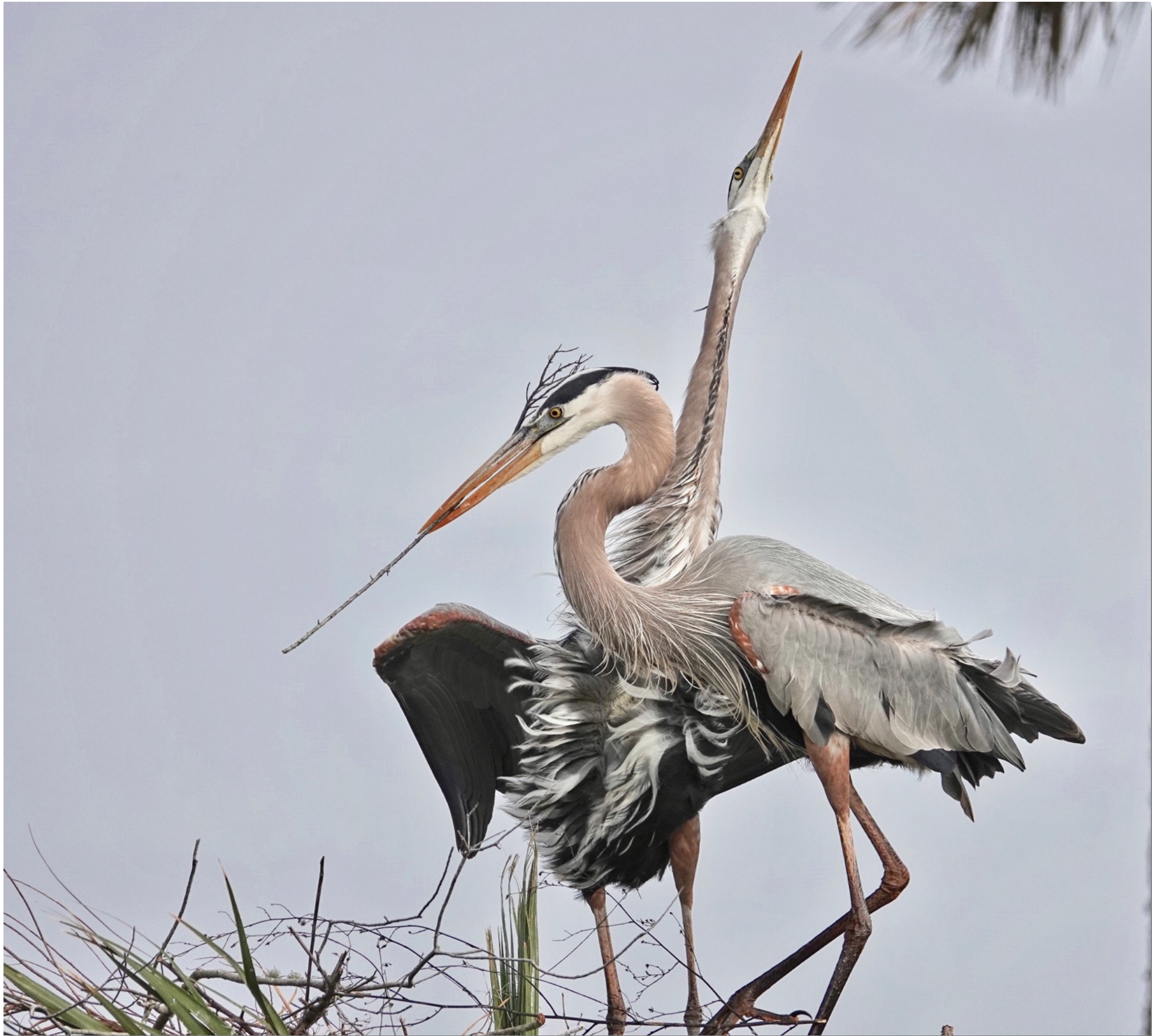
Great Blue Herons, Viera Wetlands, Florida USA, 600mm. Program/birds&wildlife. 1/1000th @ f4 @ ISO 100. Polarr. See last page for more info on Program modifications.