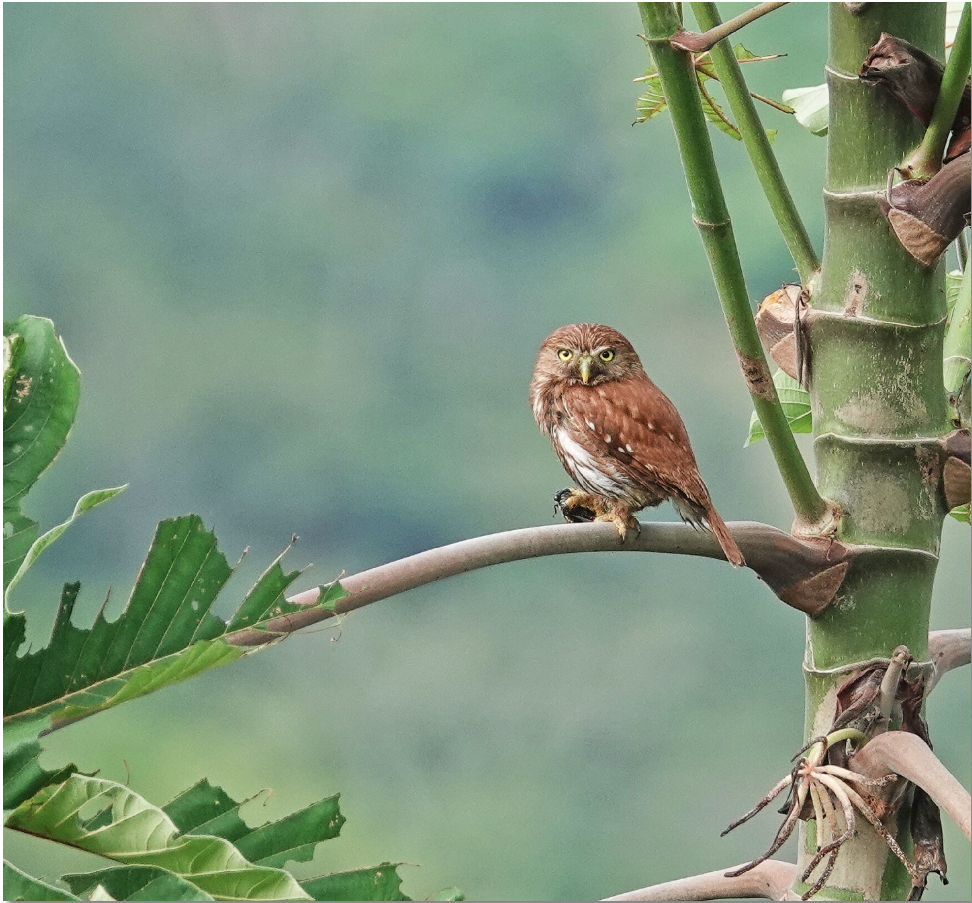
Ferruginous Pygmy Owl, Panacam Lodge, Honduras, 600mm, birds&wildlife, 1/500th @ f4 @ ISO 320, Polarr