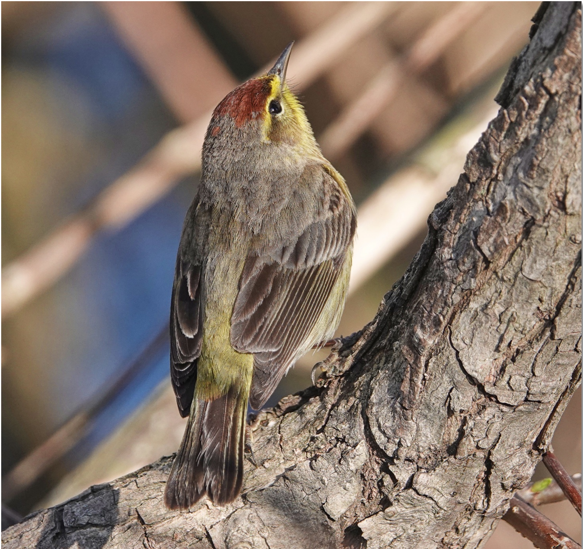
Palm Warbler, Magee Marsh, Ohio, USA, 600mm, Program/birds&wildlife, 1/500th @ f4 @ ISO 250. Polarr