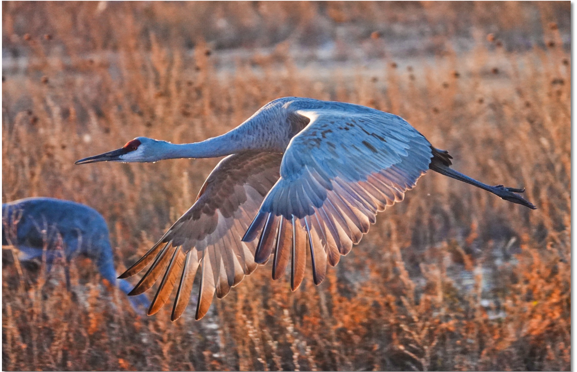
Sandhill Crane, Bosque del Apache NWR, New Mexico, USA, Program/BIF&action, 1/1000th @ f4 @ ISO 1000. Polarr.