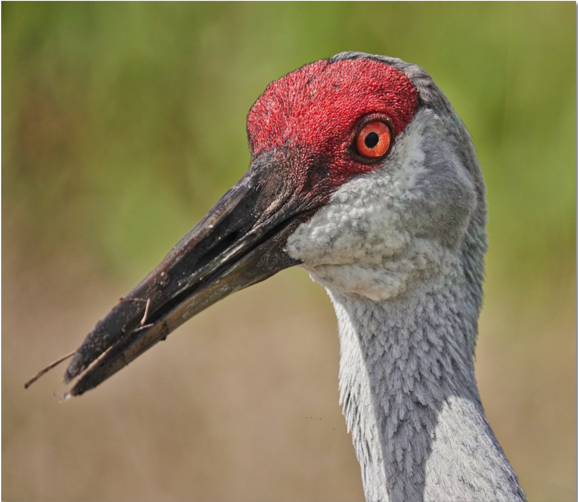
Florida Sand Hill Crane, Orlando Wetlands Park, Christmas, Florida, USA, 600mm, Program / BIF&action, 1 / 1000th @ f4 @ ISO 100, Polarr