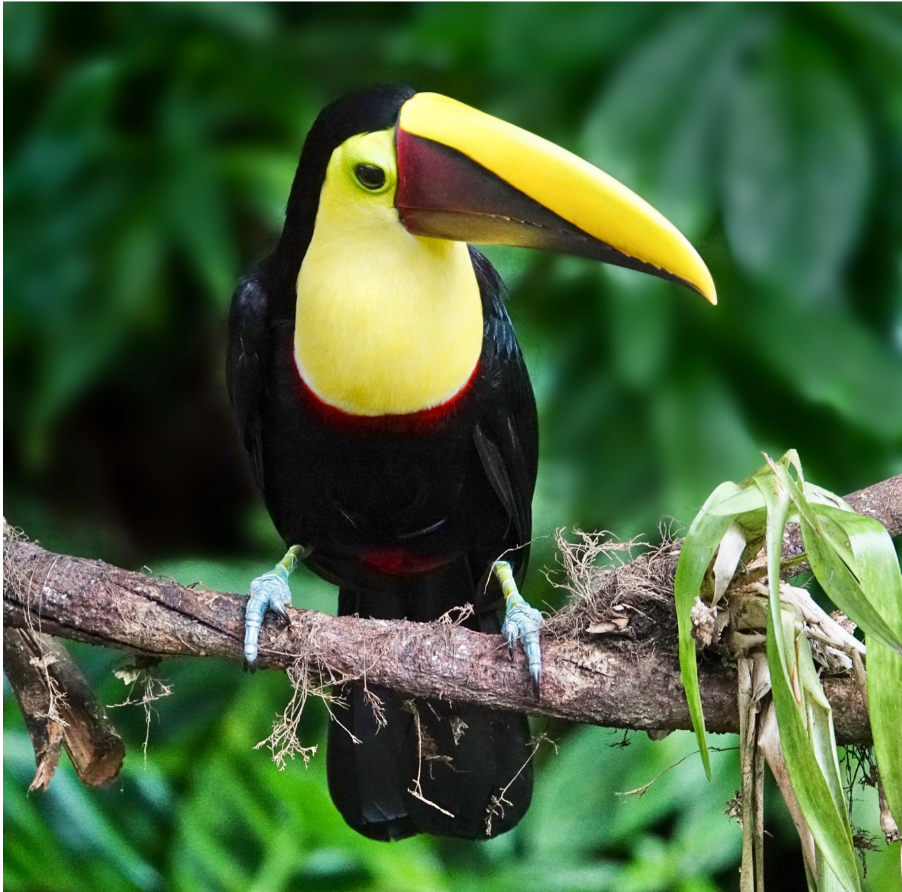
Yellow-throated Toucan, Selva Verde, Costa Rica, Anti-motion blur mode, nominally 1/250th @ f4 @ ISO 1600. Polarr