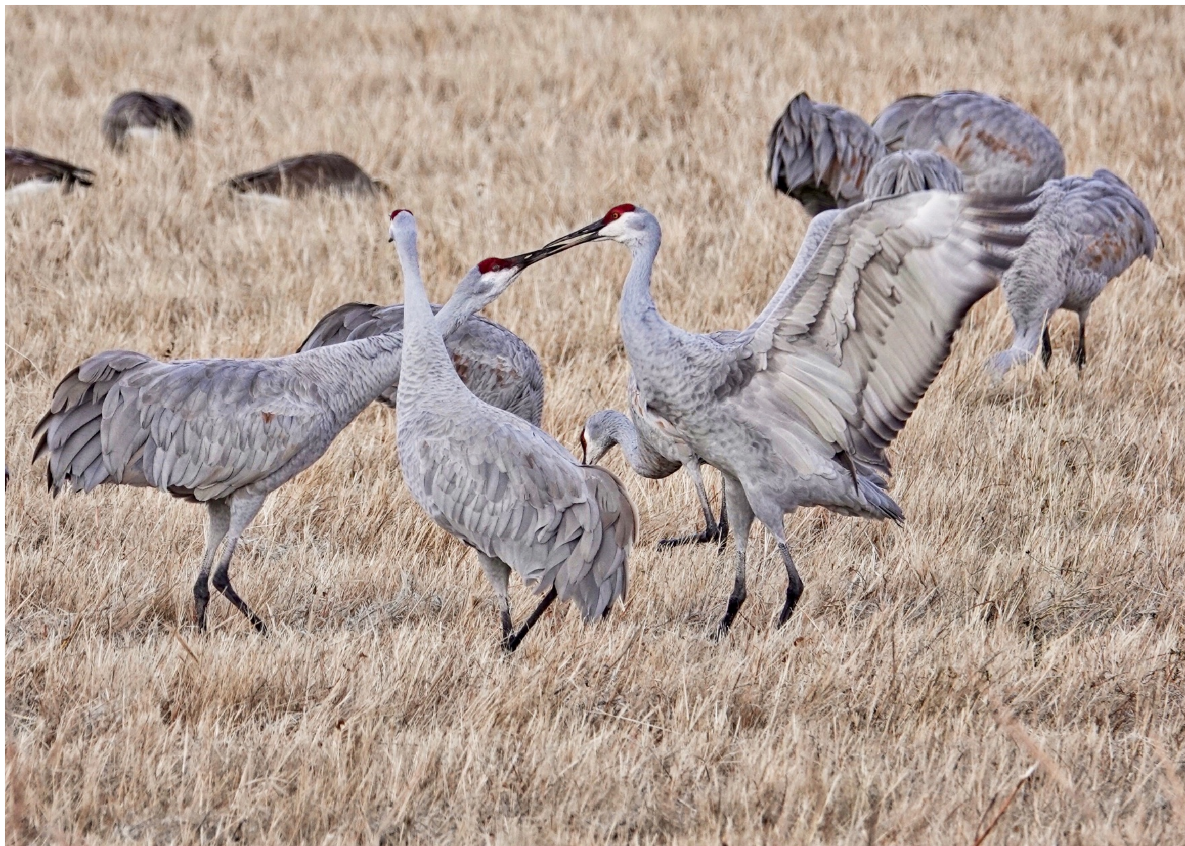
Sandhill Cranes, Bosque del Apache NWR, New Mexico, USA, Anti-motion blur mode, Polarr