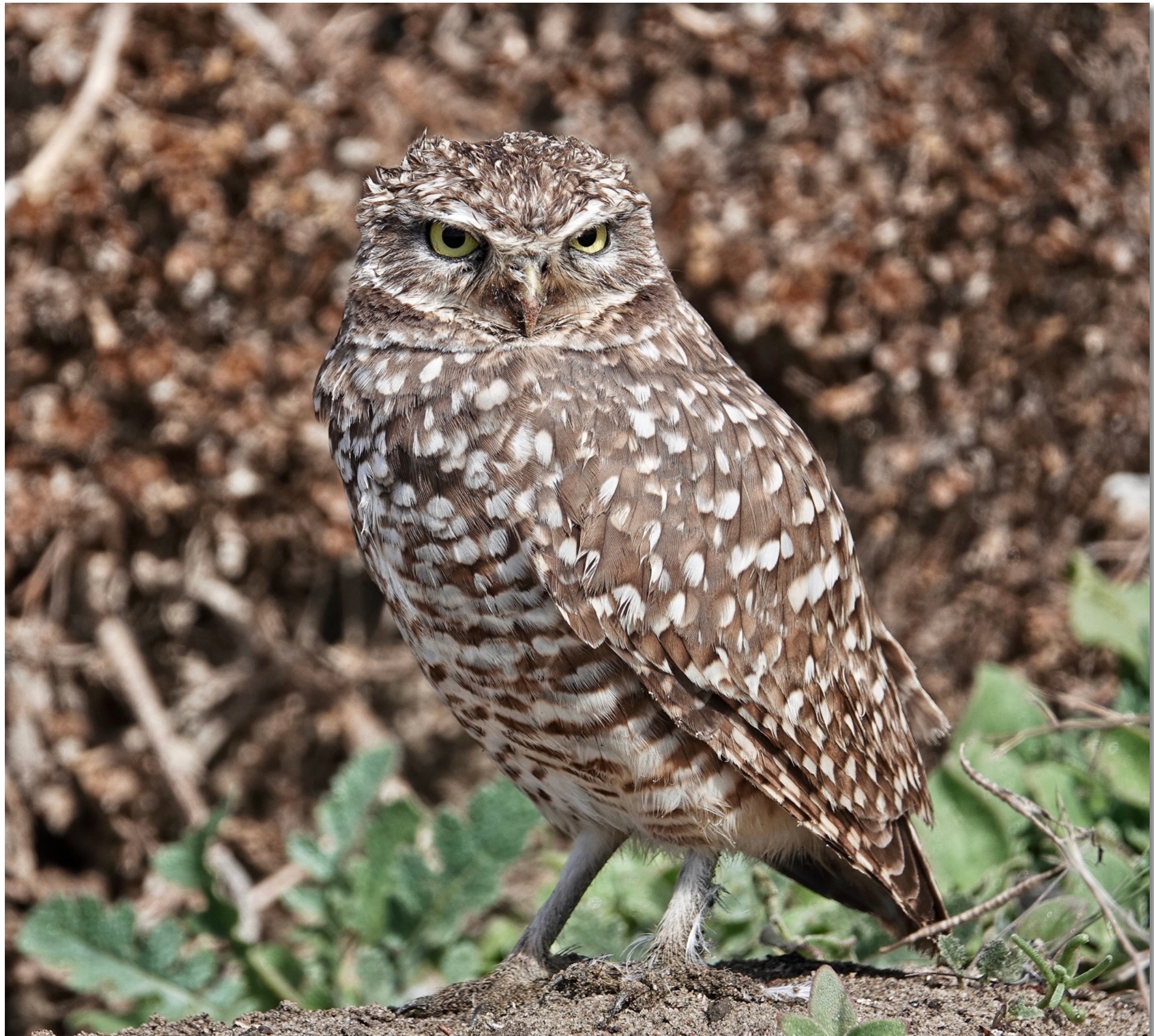
Burrowing Owl, San Diego River Channel, USA. 600mm. Program/birds&wildlife, 1/800th @ f4 @ ISO 100. Polarr.