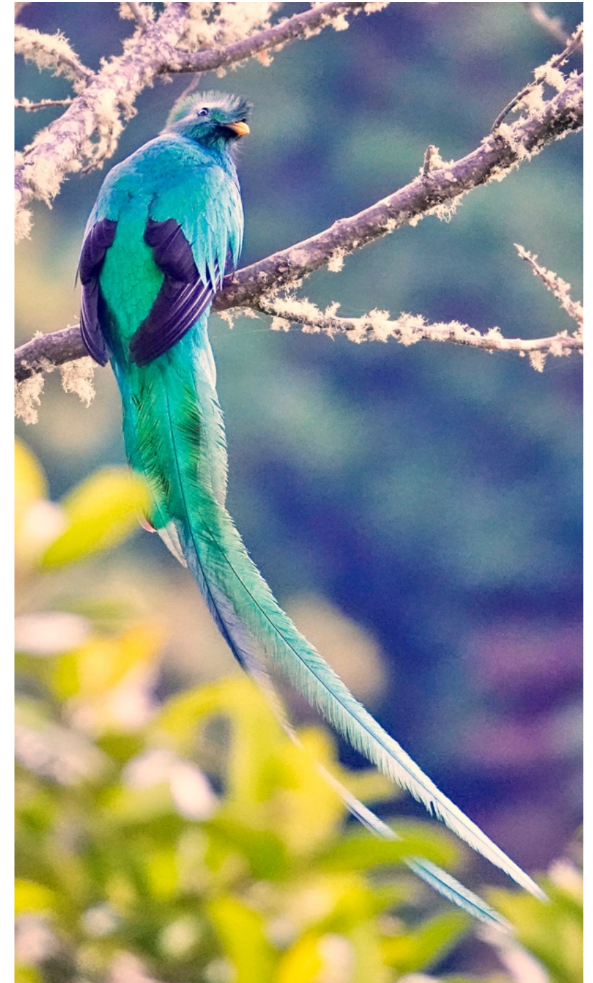
Resplendent Quetzal, San Gerardo de Dota, Costa Rica, 600mm, Program/birds&wildlife, 1/250th @ f4 @ ISO 2500 and ISO 2000. Polarr